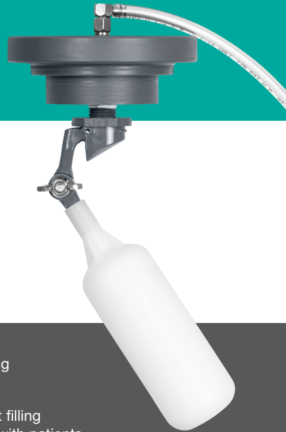
AutoFill for STATIM S3020